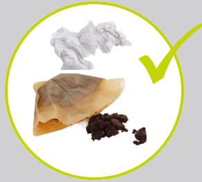
Coffee, tea, filters, napkins and paper towel