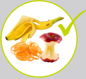
Fruit and veggie scraps