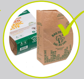
Paper compostable bags