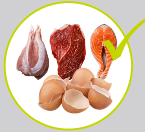
Meat, fish, bones and egg shells