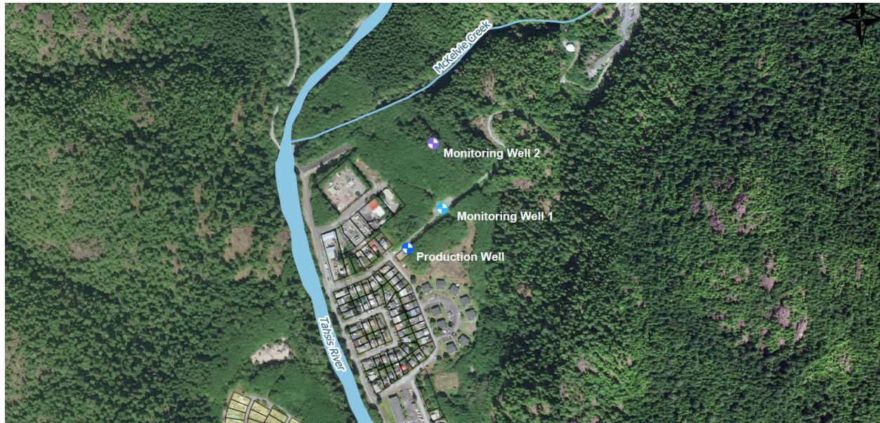
Figure 1: Monitoring Locations in Tahsis, BC

Each monitoring location has, at various times, been assigned provincial, field and laboratory identifiers; for consistency, Table 1 , below, provides a summary.