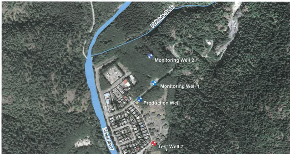
Figure 1: Monitoring Locations in Tahsis, BC

Each monitoring location has, at various times, been assigned provincial, field and laboratory identifiers; for consistency, Table 1 , below, provides a summary.