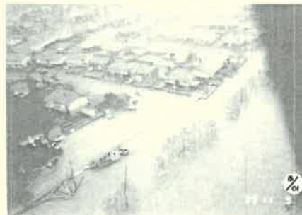
TAHSIS (Photo 4)

Looking downstream at cross section 11 and flooded Maquinna Drive during November 9, 1989 flood.