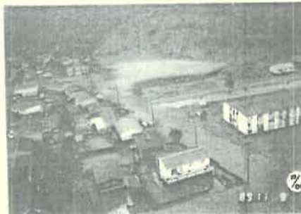
TAHSIS (Photo 5)

Looking downstream at cross section 11 and flooded Maquinna Drive during November 9, 1989 flood.