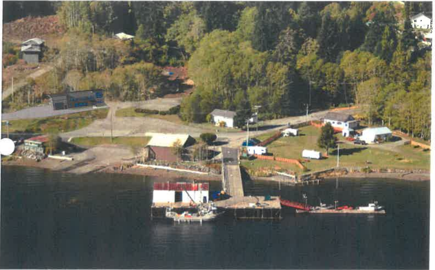
Tahsis | Search and Rescue

number TEN January 7th, 2019 2017-2018 10