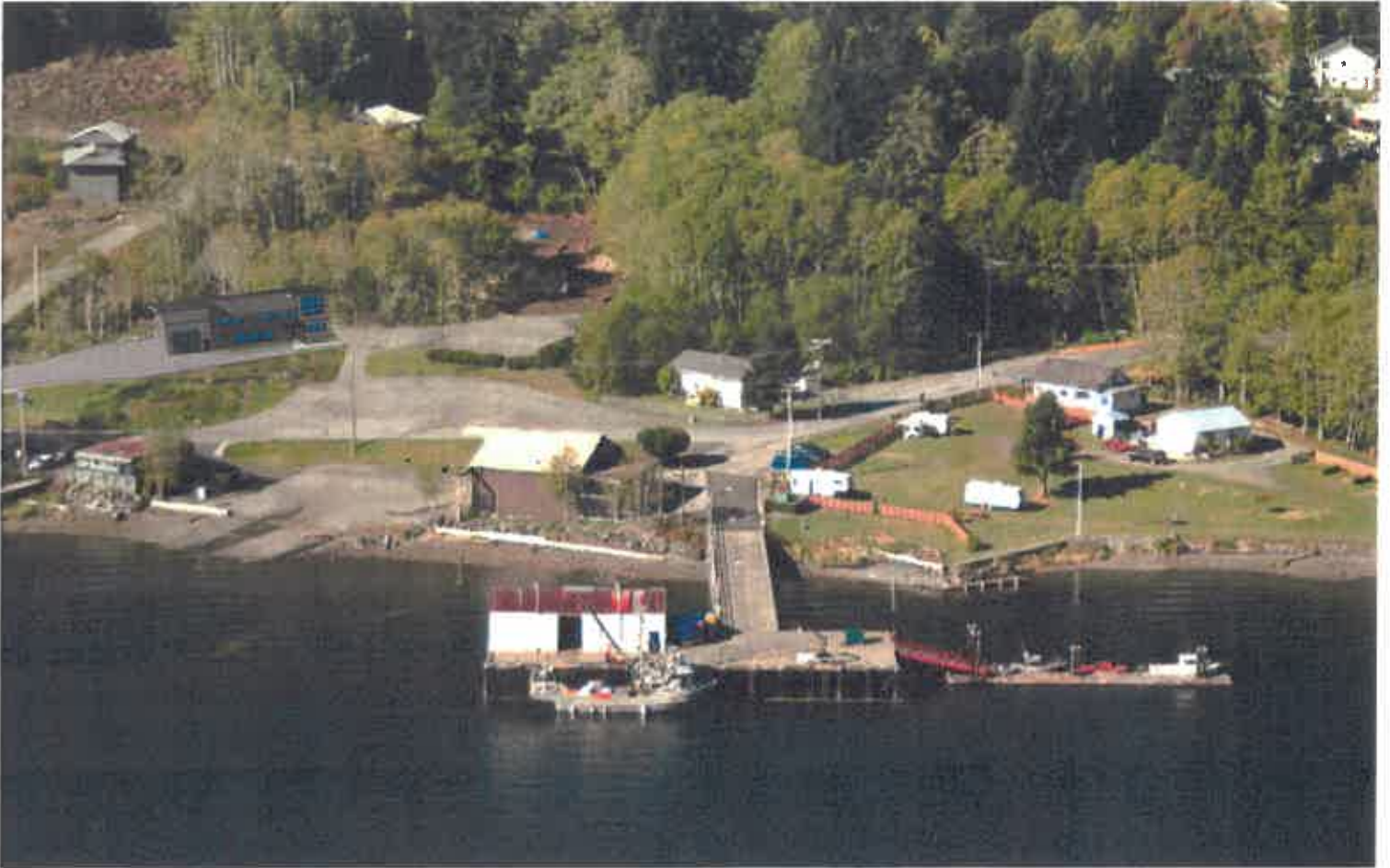
Tahsis | Search and Rescue