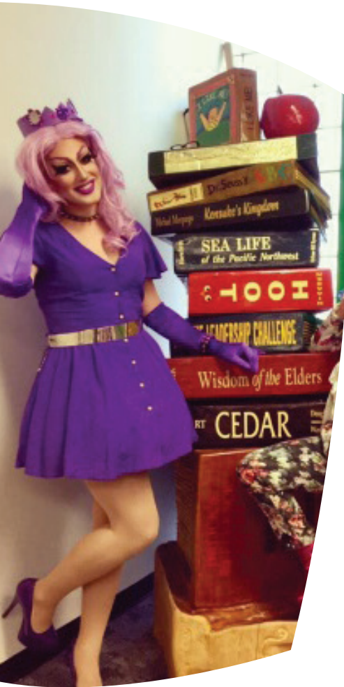
Drag Queen Storytime at the Campbell River branch.