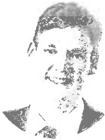
DAVID EBY VANCOUVER-POINT GREY

Housing, Liquor Policy, Gaming, Translink