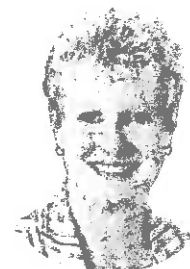
KATRINE CONROY KOOTENAY WEST

Interior Economic Development, Columbia Power, Columbia River Treaty