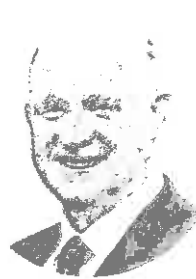
MIKE FARNWORTH PORT COQUITLAM

Immigration, Temporary Foreign Workers, Deputy Finance