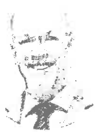
JOHN HORGAN JUAN DE FUCA

Leader, New Democrat Official Opposition